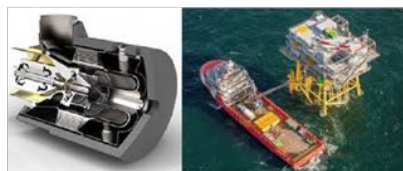
Capstone technology to decarbonize offshore platform logistics. Nowadays will run onto 10% of Hydrogen