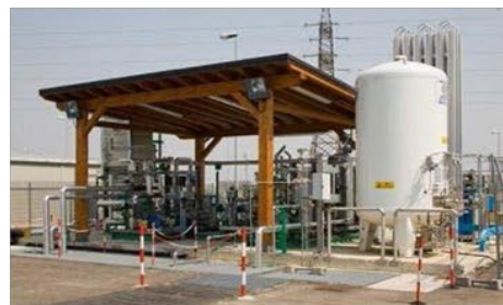
Mantova - 50 Nm3/h