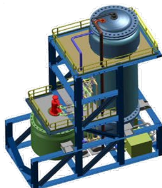
Taranto - 6000 Nm3/h